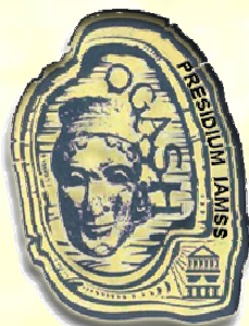
INTERCONTINENTAL ACADEMY OF MEDICAL - SOCIAL SCIENCES (IAMSS)

HAS BEEN ELECTED AS CORRESPONDENT-MEMBER OF WORLD OGASH BOARD